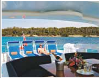
The good life