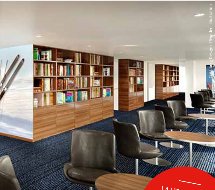
© Hillberg Design of Sweden, illustration