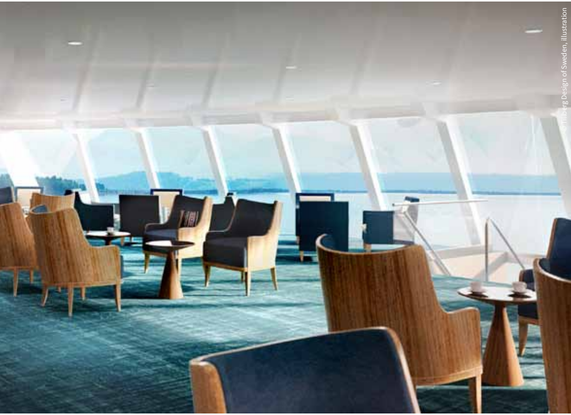
© Milberg Design of Sweden, illustration