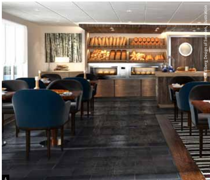
© Hillberg Design of Sweden, illustration